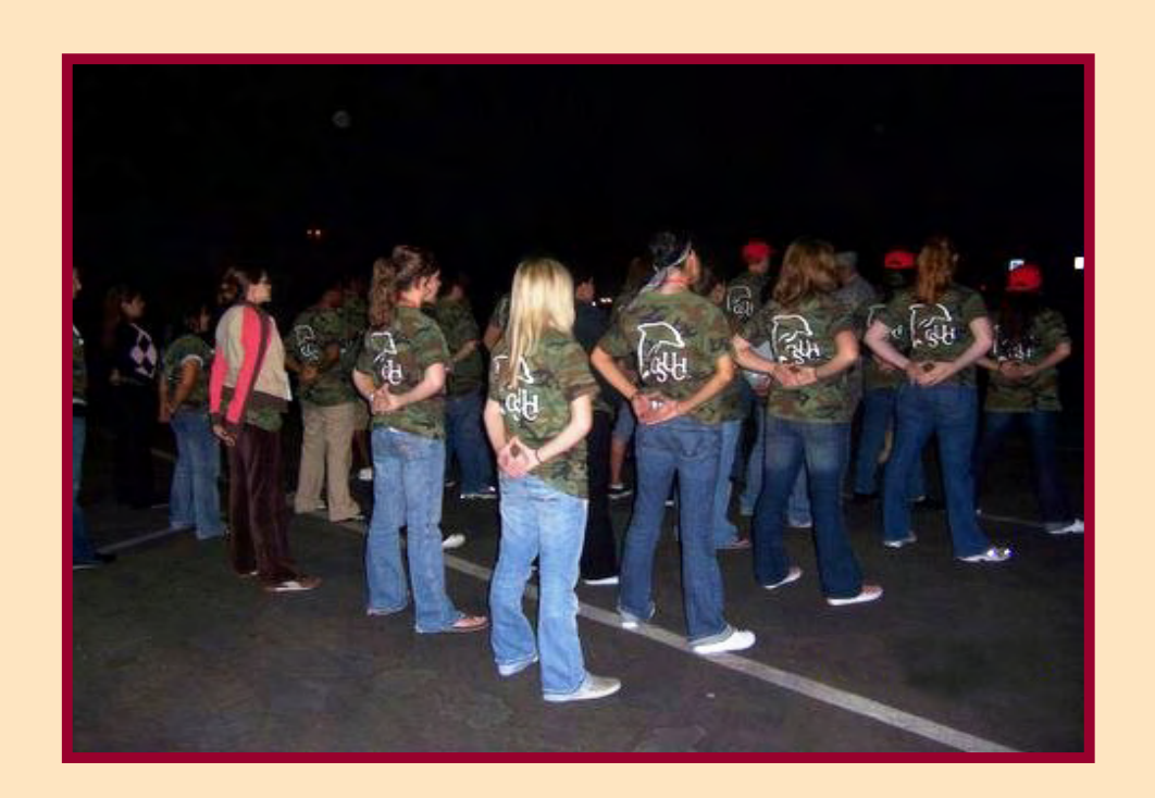
This marching practice was followed by a discussion about discipline, team work and self-awareness.

or she hoped to gain from the experience. At the conclusion of the retreat, an awards ceremony was held to award squad winners in each category as well as best overall squad. The