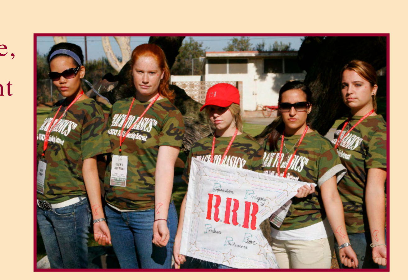
This group, self-named, "Rosie the Riveter Revolution" won the "Best Overall Squad Award."

The squads, with rotating leaders, performed competitions including a marching performance, cadence creation and performance, development of a squad name and a flag that represents squad. Squads were called upon to memorize and recite two items on the CSUCI Student Leader's Personal Code of Honor. At times during the Retreat, the Retreat General called upon individual students in front of the group to