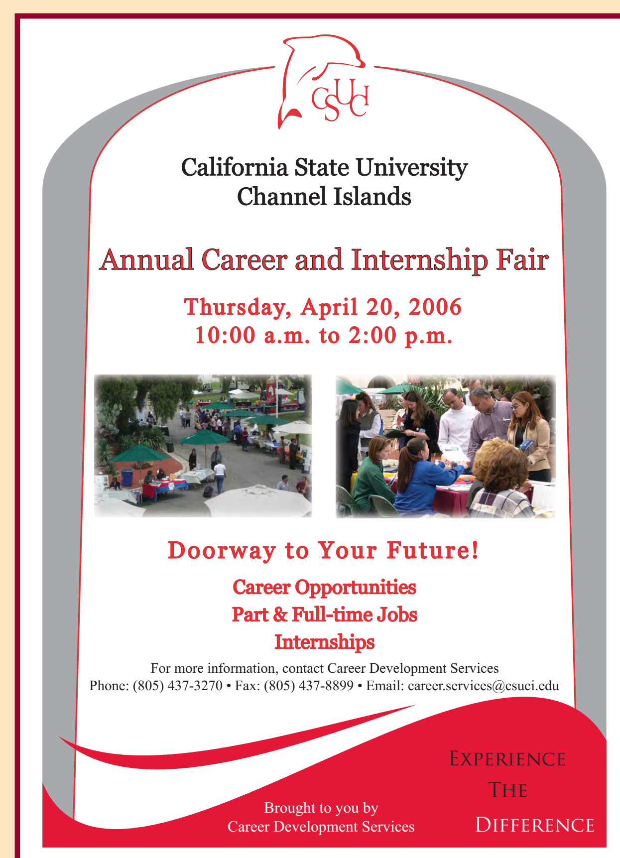
Annual Career and Internship Fair Flyer (2006)

The Career and Internship Fair is designed to reach out to college graduates as well as beginning college students who want to learn what employers are looking for and how to prepare for employment.