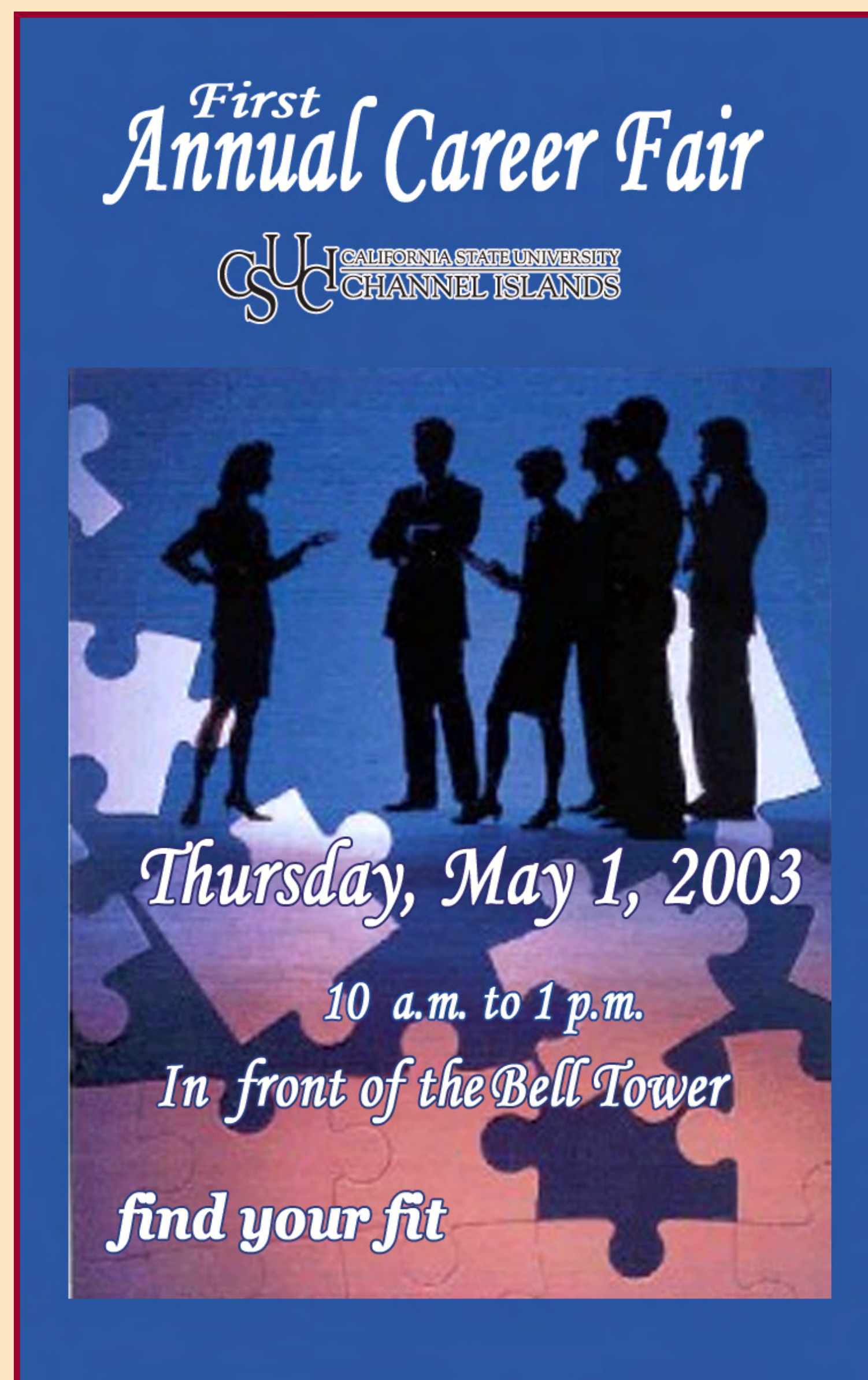
1st Annual Career and Internship Fair Flyer (2003)

The First Annual Career and Internship Fair hosted in 2003, was attended by approximately 40 employers. This year, CDS will be hosting its Fifth Annual Career and Internship Fair and projects doubling in size from the initial year with a record attendance of approximately 80-90 employers.