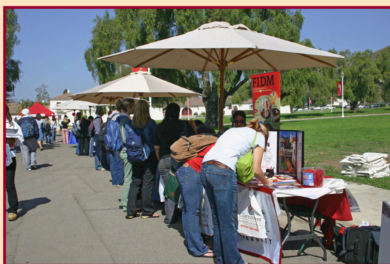
The Annual Career and Internship Fair

The Career and Internship Fair is designed to reach out to college graduates as well as beginning college students who want to learn what employers are looking for and how to prepare for employment.