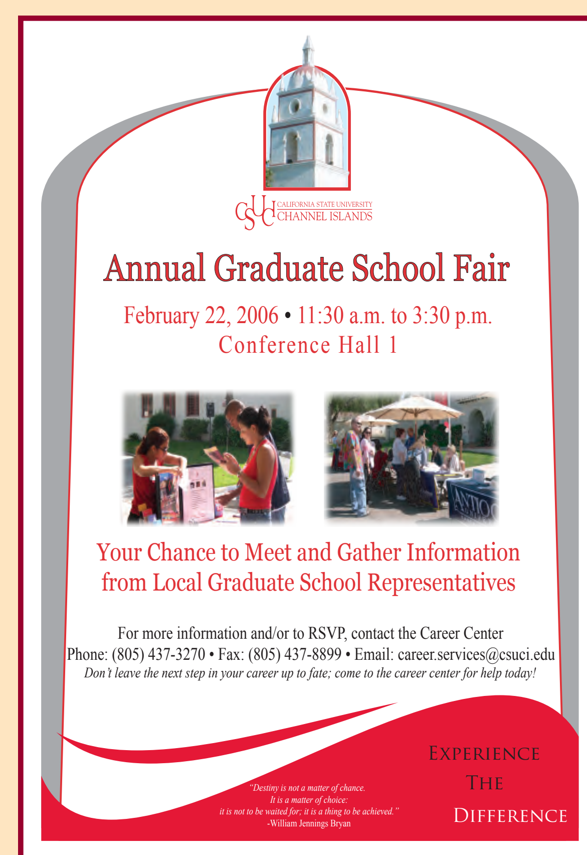
3rd Annual Graduate School Information Fair Flyer (2006)