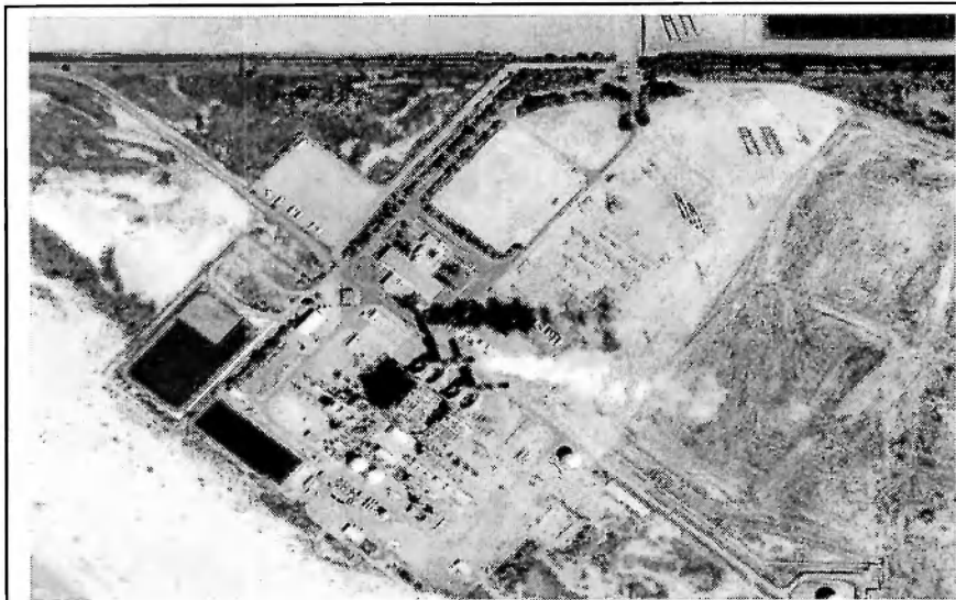
The Ormond Beach Generating Station, (former Edison facility) located at 6635 Edison Drive, in Oxnard, California.

The draft Plan, called the Closure Plan, submitted by Southern California Edison (Edison), to conduct regulatory closure of three former hazardous waste storage retention basins and associated pipelines is available for review and public comment. This draft plan includes investigation, assessment and cleanup of any contamination related to past operation of the retention basins, and ensures that the environmental systems currently in place continue to be effective in protecting human health and the environment.