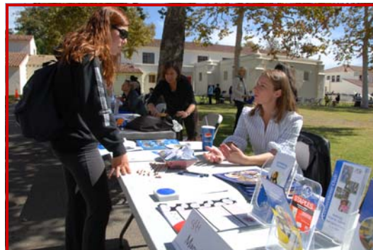
CSUCI students attended the Volunteer Fair during Citizenship Week.

Citizenship Week provided an awareness about the issues that impact the community, helped promote the endeavor to end hunger and homelessness, and bring greater solidarity and understanding, as well as promote future civic involvement of CSUCI students.