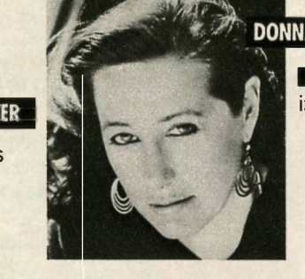
A life in fashion