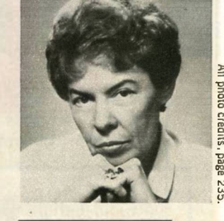
JEANE KIRKPATRICK A voice for