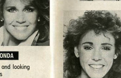
Fifty and looking fabulous