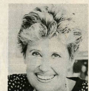
ERMA BOMBECK Still tickling America's funnybone