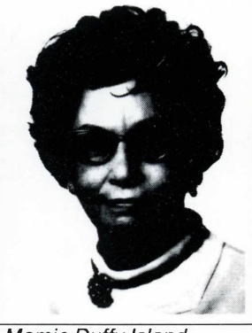
Mamie Duffy Island