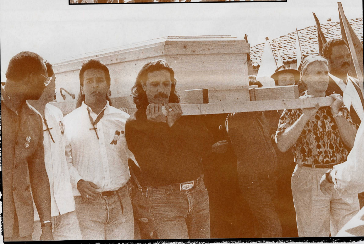
15 Some of the roughly 50,000 people who marched behind Cesar Chavez' casket at his funeral on April 29, 1993 in Delano.