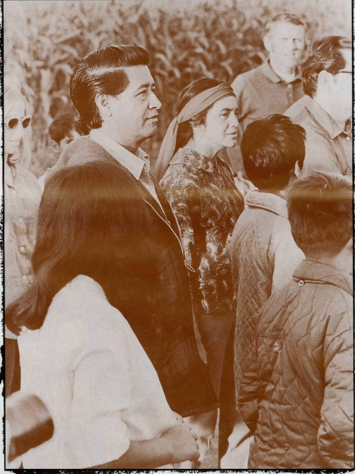
1 Cesar Chavez leading a march by grape strikers on the streets of Delano in March 1966.