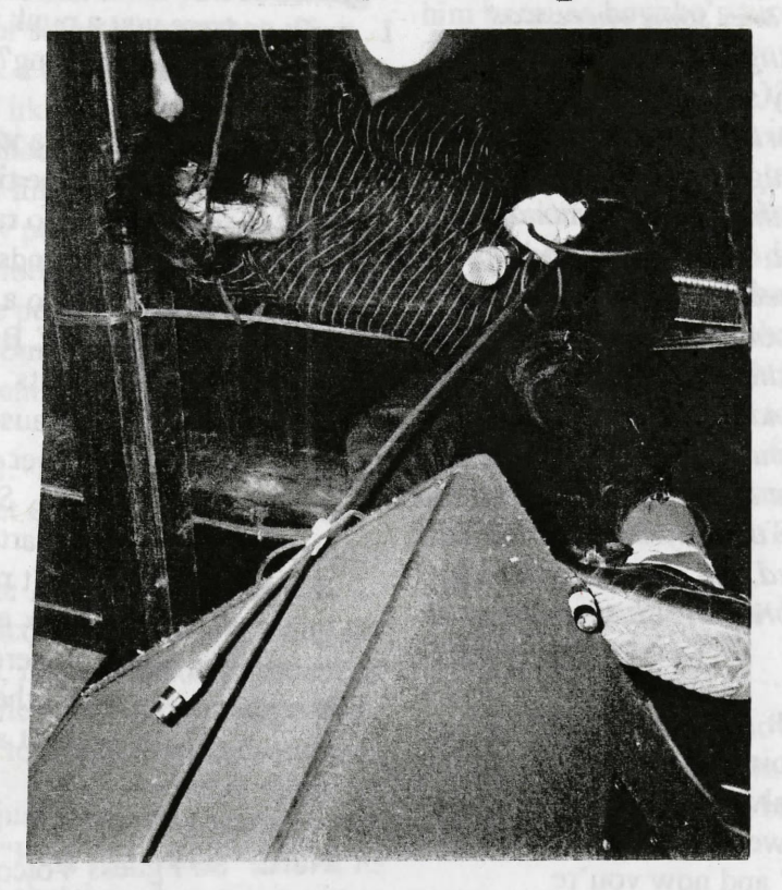
"I think everybody at thirteen likes crummy music."