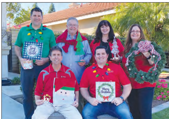
The Barlow Group BRE #01945712

For links to local charities, volunteer organizations and volunteer opportunities, visit the 'Barlows Got Your Back' section of our website.