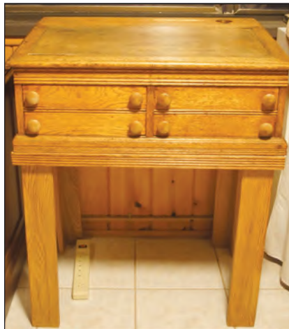
Base for vintage school desk. The free furniture repair service by Woodshop workers is backed up because the club no longer has a full team of volunteers.

A reminder: the Woodshop is open from 10am until Noon, every Wednesday and Thursday, to accept your repair requests. Dur-