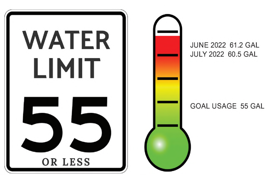
Reduce your personal water usage to 55 Gallons or less per person per day in your household

The details of looming penalties are not perfectly clear at the time of this writing. Several agencies from the state level down to our local water boards are attempting to work out these details, each with their own ideas, strategies and plans. In the meantime, leadership in the Village has taken a proactive lead and is attempting to stay ahead of the "crisis" curve. The LV Board of Directors has established an advisory committee called Long Range Planning; This committee has assembled a group of Village residents to monitor the water situation and keep all of us informed as it develops. The Water -Please see PAGE 8