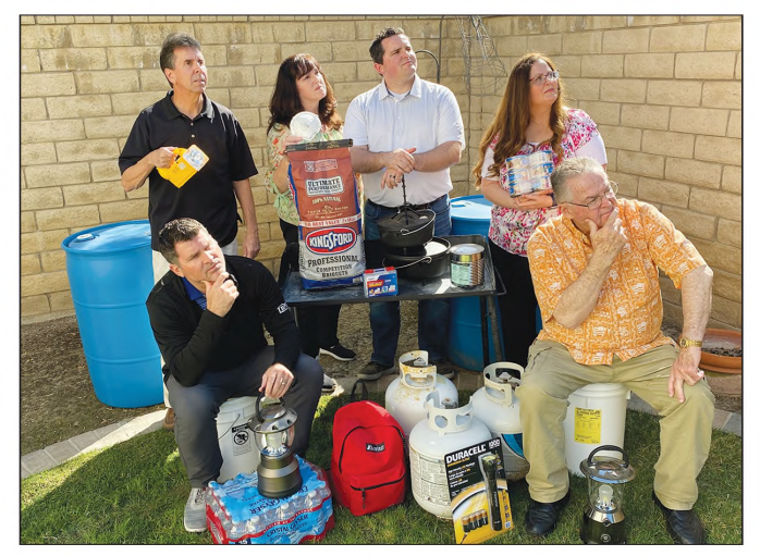
The Barlow Group BRE #01945712

The Barlows are prepared to help you with all of your Real Estate needs. We have a plan in place to serve you!