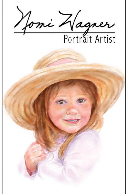
Portrait Paintings inspired by your favorite photos

Each Office is Independently Owned and Operated. This is not meant as a solicitation if your property is already listed with another Broker. 08LV03S