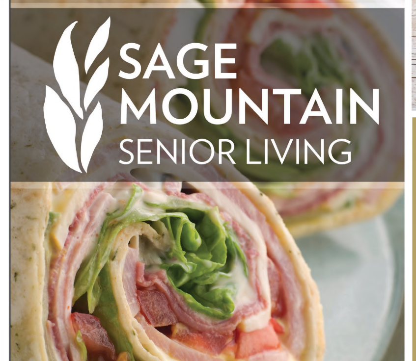
Learn about our move in specials. 占自